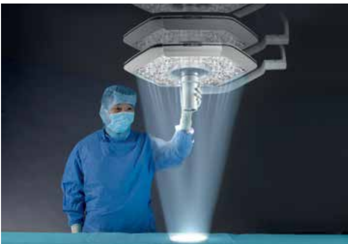
Consistent illumination at typical working distances.

The iLED® 7 Surgical Light's 3D sensor system provides consistent lighting conditions and eliminates unwanted shadows, even when the surgeon is working directly beneath the light head. The system identifies obstacles in the field of illumination and activates or deactivates individual LED modules accordingly. As a result, the surgical field is properly illuminated without the need for manual adjustment allowing the surgeon to focus on the patient and the task at hand.