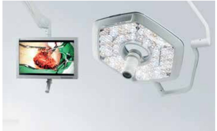
TruVidia® Wireless Camera System provides excellent image quality and encrypted transfer provides maximum data security.

The iLED® 7 Surgical Light can be directly connected to the innovative TruVidia® Wireless Camera System via the handle, providing clear images in full HD. Individual images for documentation purposes are possible using the snapshot function. Benefits of wireless technology: ability to install and/or upgrade this system with minimal additional cost or the need for complex video cabling.