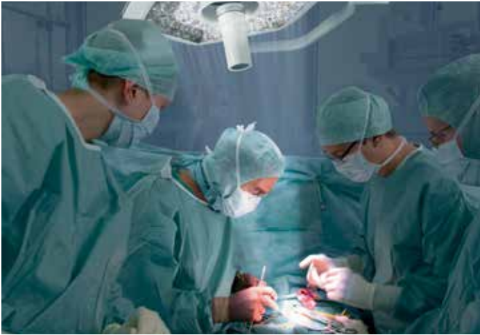
3D sensor technology provides consistent lighting of the surgical site.