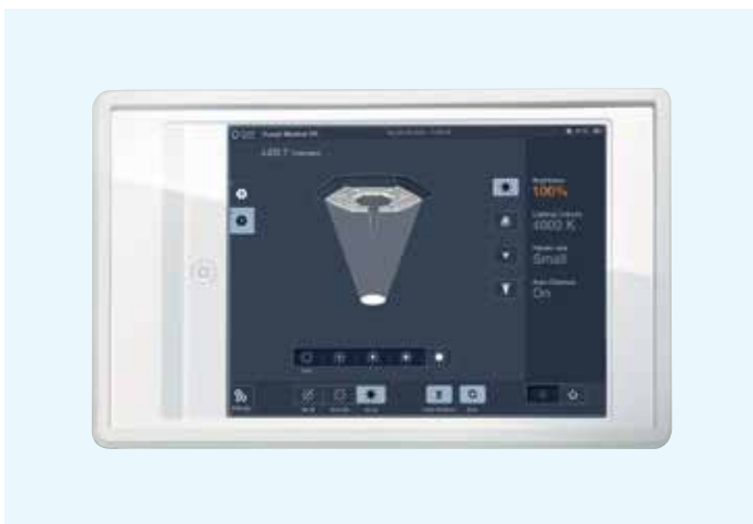
Intuitive and reliable wall control.

Once the surgeon has selected the pattern size (6", 8" or 10"), the light head automatically maintains that size throughout the procedure, at any typical working distance.