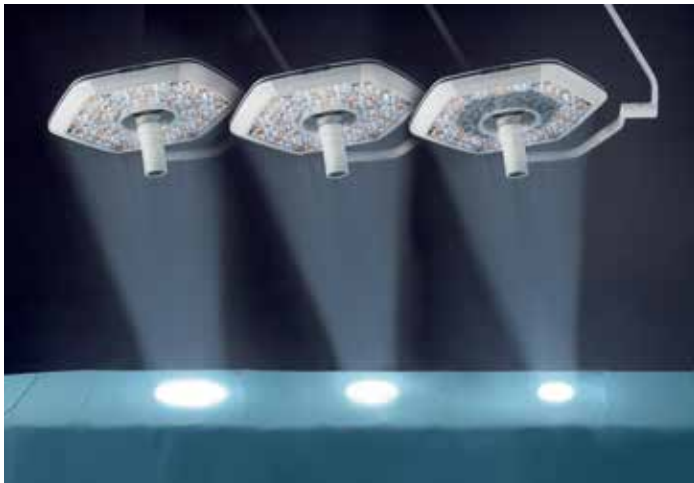
Optional pattern sizes: 10", 8" or 6".