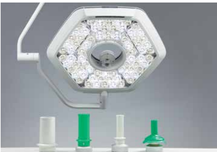
All iLED® 7 Surgical Light's are camera ready — enabling you to upgrade at any time.

When the light head is repositioned, the 3D sensor automatically adjusts to ensure a consistent illumination level. This eliminates any manual readjustments to the lighting conditions — saving time and allowing the surgeon to focus on the surgical site.